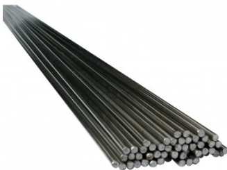
W1142C Ø1.6mm TIG Filler Rod - Aluminium