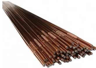
W1142 Ø1.6mm TIG Filler Rod - Mild Steel