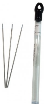
W1142Z 3.2mm Tig Tungsten Electrode - Zirconiated White