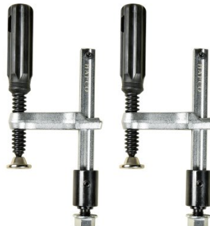
W08510 Weld Clamps with Locking Nuts (2 Piece Pack)