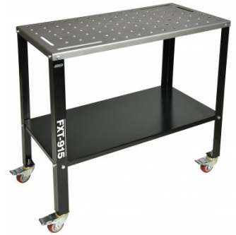
W08450 FIXTURE TABLE