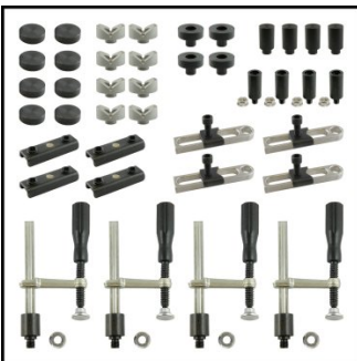
W08500 40pc Square & Round Welding Table Clamp Kit