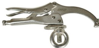
C103 228mm Multi-Purpose Locking Clamp