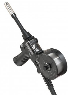
W181C Spool Gun - Light Duty