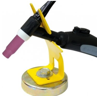
W10361 Magnetic TIG Torch Rest