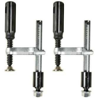
W08510 Weld Clamps with Locking Nuts (2 Piece Pack)