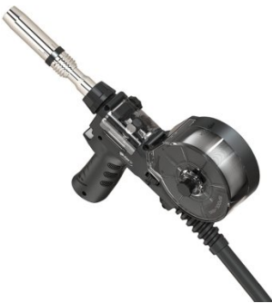
W181D Spool Gun