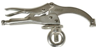
C103 228mm Multi-Purpose Locking Clamp