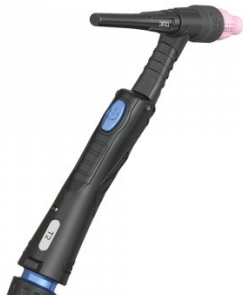
W171C Air Cooled Arc Torchology® TIG Welding Torch