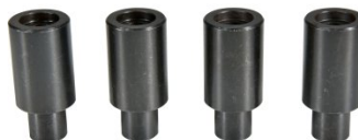
W08515 38mm x M12 Multi-Purpose Riser/Stops (Spigot Type) - 4pc Pack