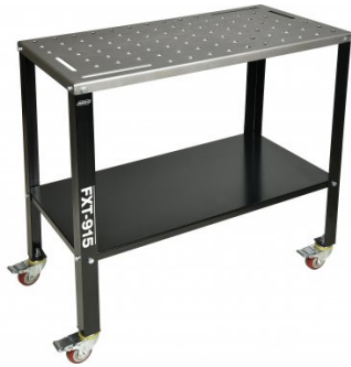
W08450 FIXTURE TABLE