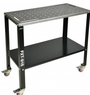
W08450 FIXTURE TABLE