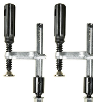
W08510 Weld Clamps with Locking Nuts (2 Piece Pack)