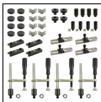
W08500 40pc Square & Round Welding Table Clamp Kit