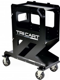
W2415 TRI-CART Multi-Machine Welding Trolley