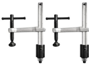
W08512 Weld Clamps with Locking Nuts (2 Piece Pack)