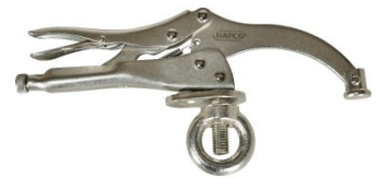
C103 228mm Multi-Purpose Locking Clamp