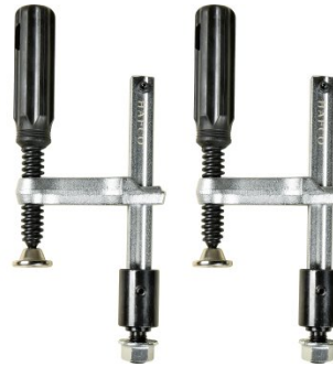
W08510 Weld Clamps with Locking Nuts (2 Piece Pack)