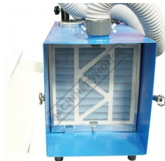
Easy Access to Filter