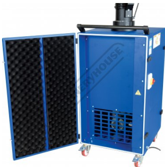
Rear Door Access Panel