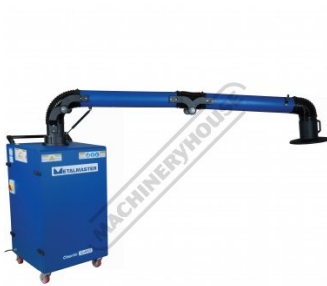
3 Metre Arm Extended