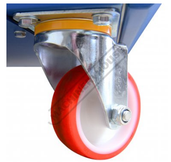
2 x Swivel Wheels