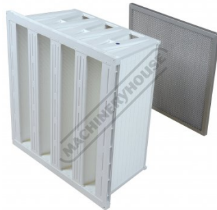
Dual Stage Filter System