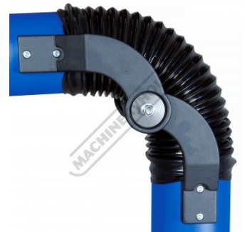
Exo Centre Arm Joint