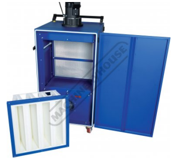
H13 Hepa Filter