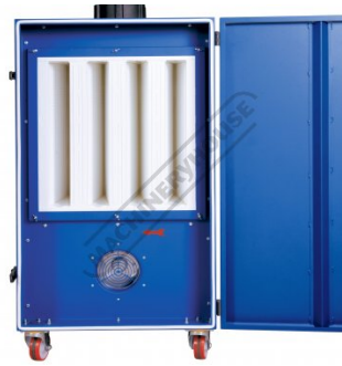
Front Door Access Panel