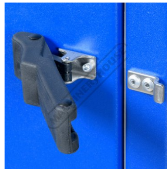
Quick Action Door Panel Locks