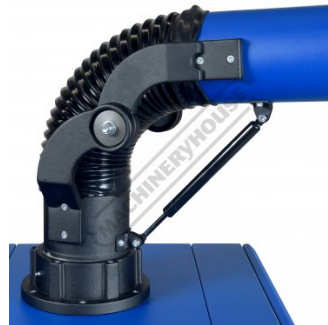
Exo Joint With Gas Strut Support