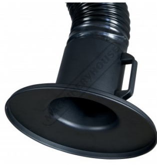
Fume Extraction Head