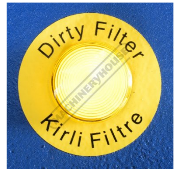
Dirty Filter Light Indicator