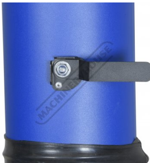
Air Flow Control Valve