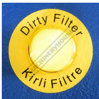
Dirty Filter Light Indicator