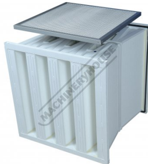
Pre Filter & Hepa Filter System