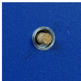
Inlet Spark Arrestor