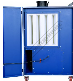
Left Side Door Access Panel