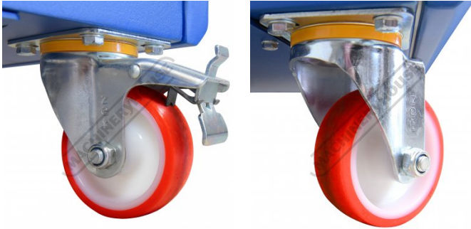
2 x Swivel Lock Wheels with Brake 2 x Swivel Wheels