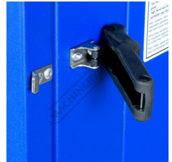
Quick Action Door Panel Locks