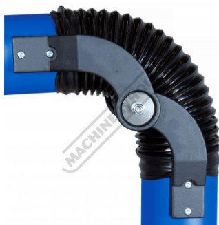
Exo Centre Arm Joint