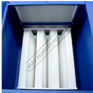
H13 Hepa Filter Assembly