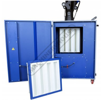
Dual H13 Hepa Filter