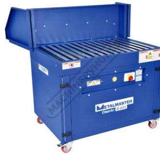
Side doors open