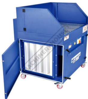
Filter door open