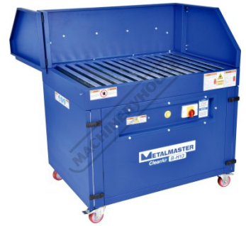
Side door open