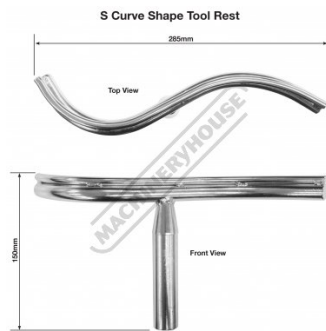
S Curve Shape Tool Rest