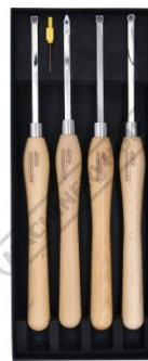
Top View In Case