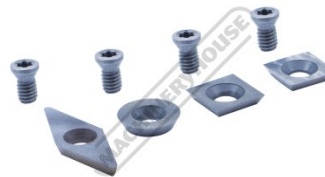
Replaceable Carbide Tips