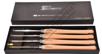
Box Packaging Open