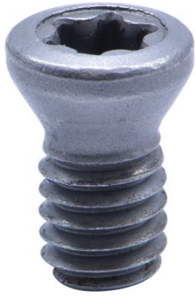
W30494 M4 - Torx Head Screw