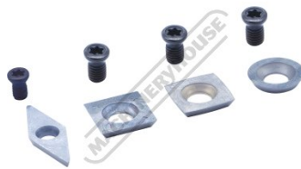
Replaceable Carbide Tips