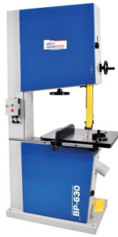
W429 Wood Band Saw