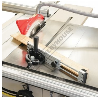
Shown on a Table Saw