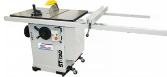
W455 Table Saw