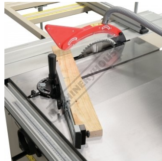
Shown on a Table Saw Side View