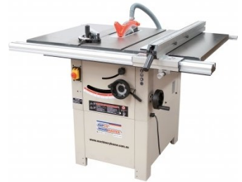
W486 Table Saw