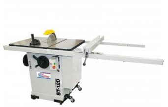
W455 Table Saw