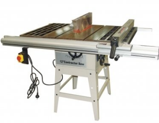
W452 Table Saw