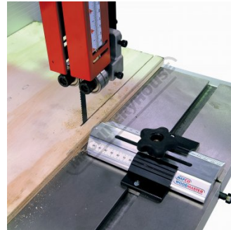
Shown In Use on Bandsaw