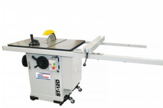
W454 Table Saw