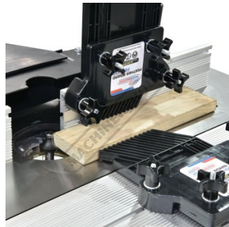
In Use Router Table