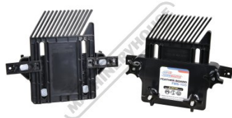
Front and Rear View