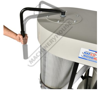
Rotary Hand Filter Cleaning