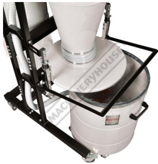
Quick Release Handle for Bucket Empty