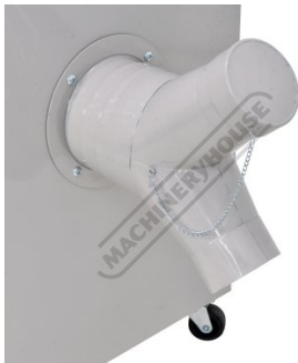
100 Dual Inlets