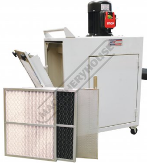
3 Stage Filter System - 1 Micron