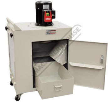
Removable Dust Collection Bin