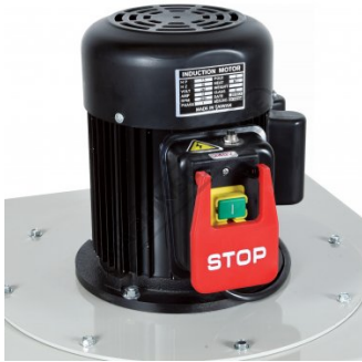
Motor & Safety Emergency Power Switch