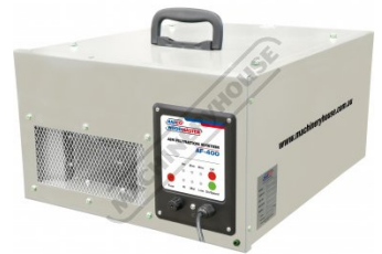
Shown with Lifting Handle