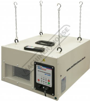
Includes Ceiling Hooks and Chains