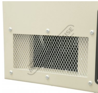
Clean Air Outlet