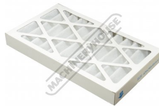
First Stage External Filter