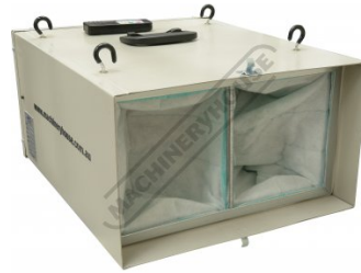
Rear View with 1st Stage Filter Removed