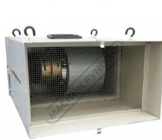
Shown with Filters Removed