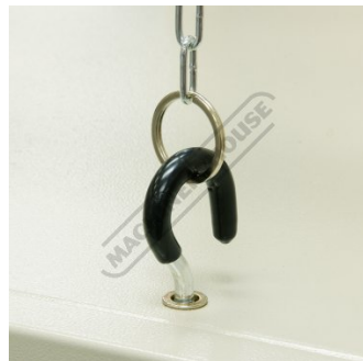
Swivel Mounting Hooks