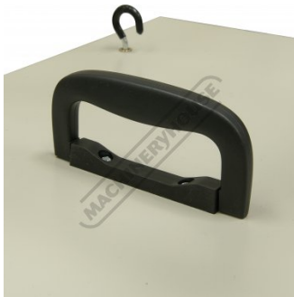
Lifting Carry Handle