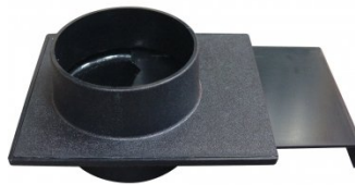
W335 Blast Gate