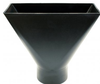
W338A Wood Lathe - Dust Chute Hood