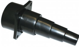
W334A Dust Hose Stepped Reducer