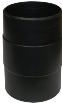
W334B Dust Hose Joiner