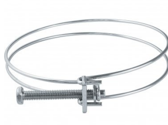
W341 Dust Hose Clamp