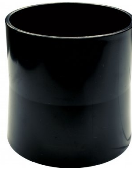
W3395 Quick Connect Adaptor