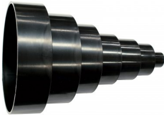
W3346 Dust Hose Stepped Reducer