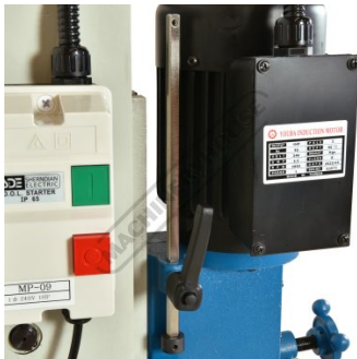
Adjustable depth stop