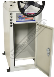
Large storage cabinet