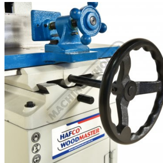
Cross slide and table travel handwheel