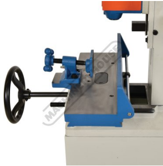
Table Travel-heavy duty device