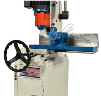
Table movement left and right