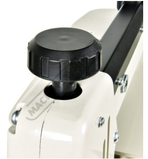
Blade Tension Handle