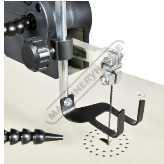
Blade Guide Adjustment