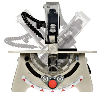
Tilt Head 45 Degrees Left and Right