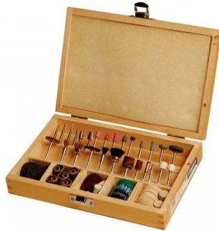
W348A Scroll Saw Accessory Kit