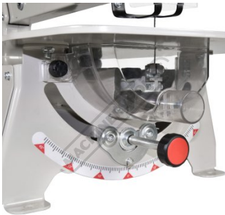
Dust Extraction Chute Tilt Handle