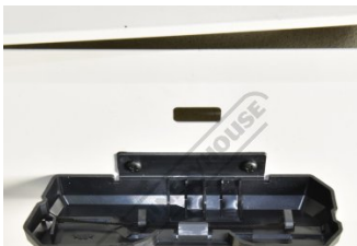
Blade Storage Holder Open