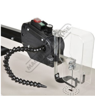
Dust Blower and Safety Guard