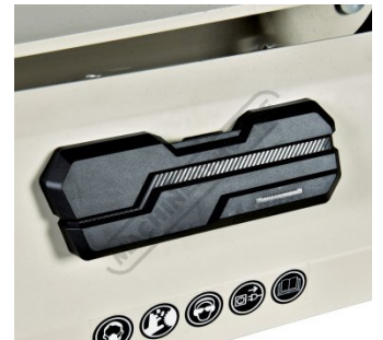
Blade Storage Holder