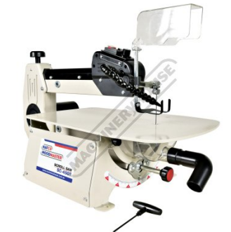
Shown with Safety Guard Raised