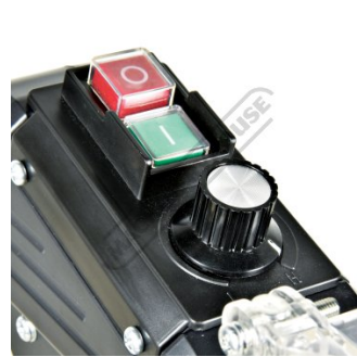
Variable Speed Dial and On Off Switch