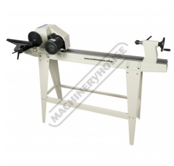
Bowl Turning Setup Right View