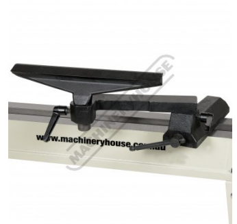
Outrigger Tool Rest