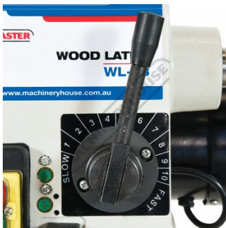
Variable Speed Lever