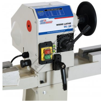
Headstock Left View