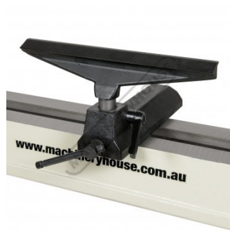
Standard Tool Rest