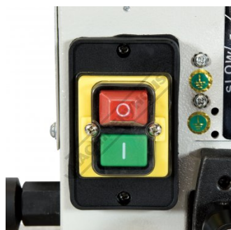
Switch On Off