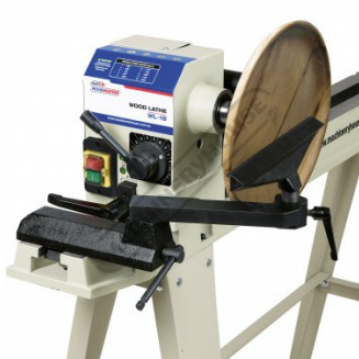
Shown Set Up with Bowl