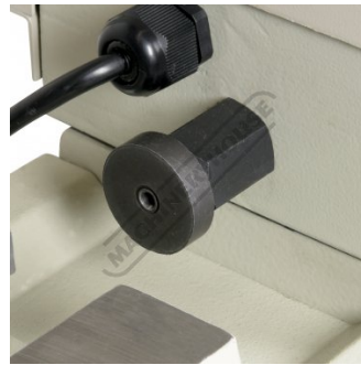
Swivel Head Release Lock