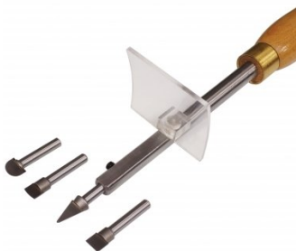
W301 HSS Wood Turning Tools - 8 Piece Set