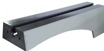
W379X Adjustable Wood Lathe Stand Extension