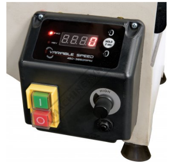
Electronic Variable Speed