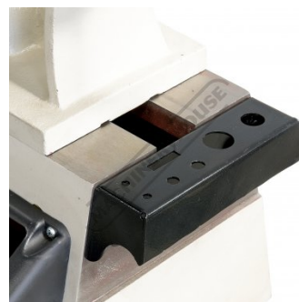
Tool Storage Tray