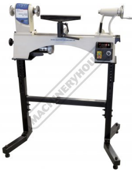
Shown on Optional Stand