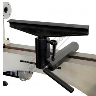
300mm Tool Rest