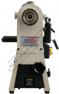
Left End View