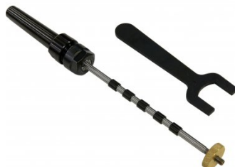
W306 Pen Mandrel Set - 2MT