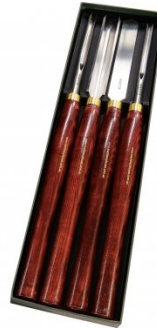
W3039 HSS Wood Turning Tools - 4 Piece Set