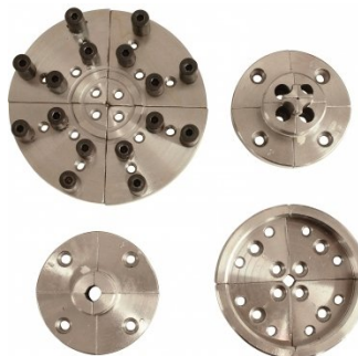
W375 Scroll Chuck Accessory Kit