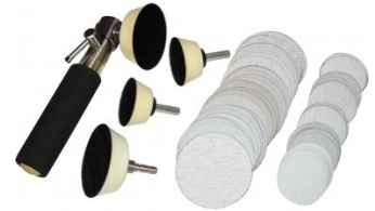
W305 Bowl Sanding Tool