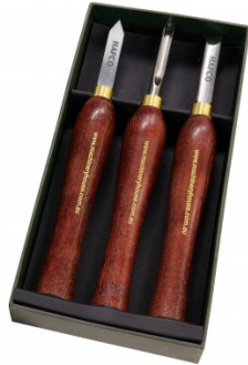
W3033 HSS Pen Turning Tools - 3 Piece Set