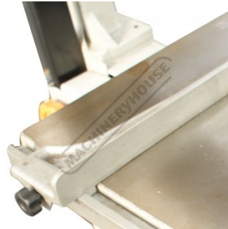
Sliding Rip Fence