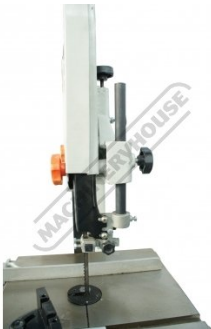
Blade Height Adjustment