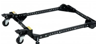
W930 Mobile Base