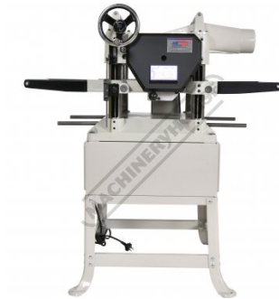
W414 Side View