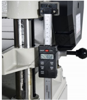
Digital Height Readout