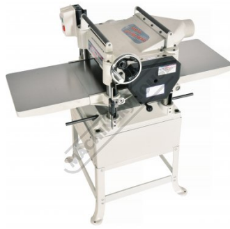
Cast Iron Feed Table