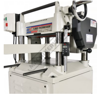
Robust 4 Post Design