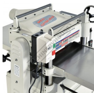
Feed Return Rollers