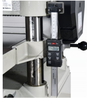
Digital Height Readout