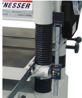
Digital Height Readout