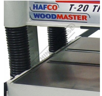
Robust 4 Post Design