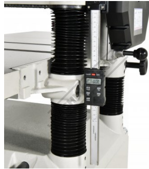
Digital Height Readout