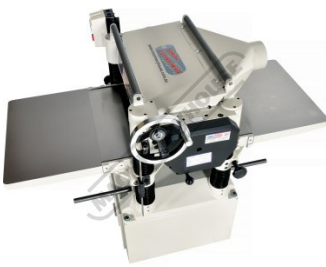
Cast Iron Feed Tables