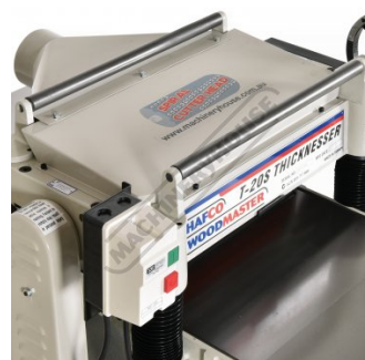
Feed Return Rollers