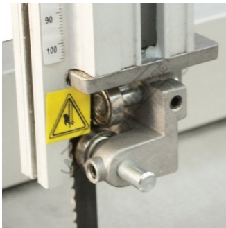
Ball Bearing Blade Guides