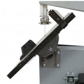
Cast Iron Table Tilts 0 45 degrees