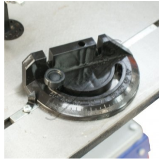
Mitre Guide 0 45 Degrees