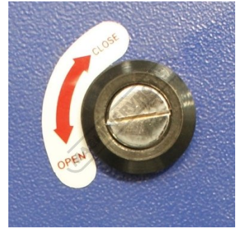
Safety Locks on Doors