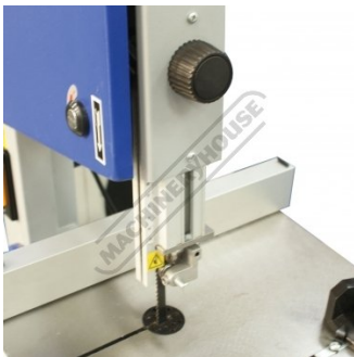
Blade Guide Adjustment