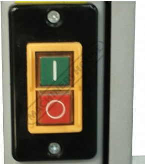
Magnetic Safety Switch