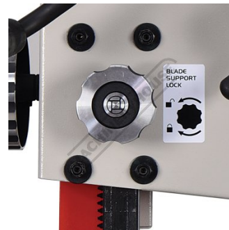
Quick Action Blade Tension Lever