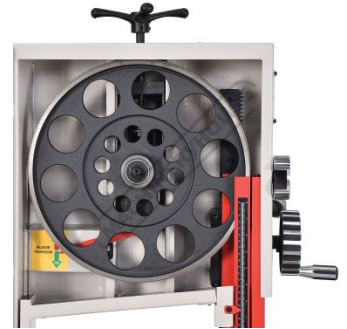
Heavy Duty Cast Iron Wheels