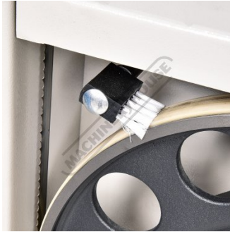
Blade Cleaning Brush