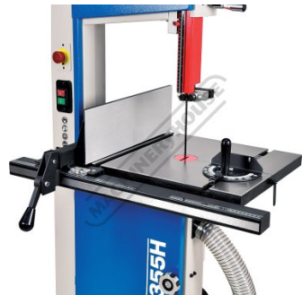
Sliding Rip Fence Up Position