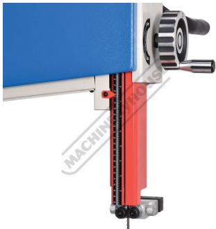
Blade Guide Scale