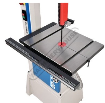
Large Cast Iron Table