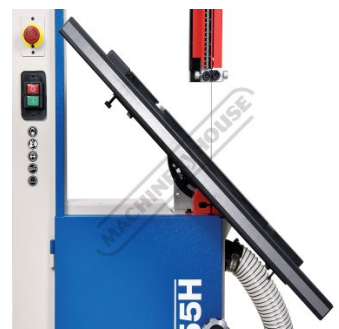
Table Tilts to 45 Degrees