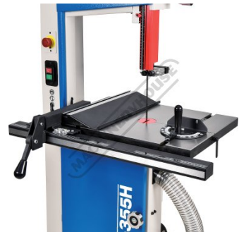
Sliding Rip Fence Down Position