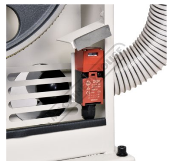
Safety Micro Switch on Doors