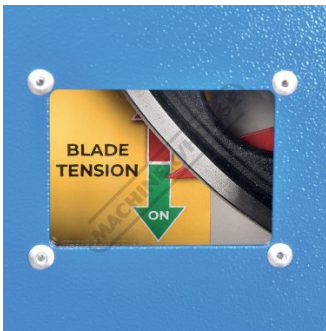
Blade Tension Window