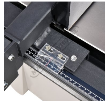
Sliding Rip Fence Scale