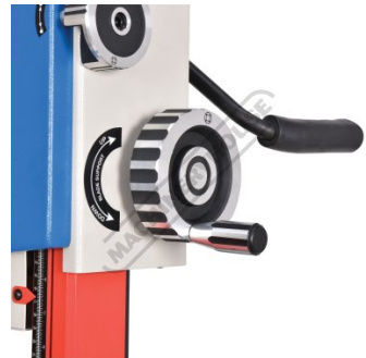
Blade Guide Hand Wheel