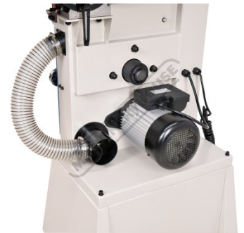
100mm Side Dust Chute