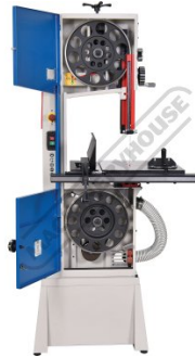
Shown With Blade Guards Open