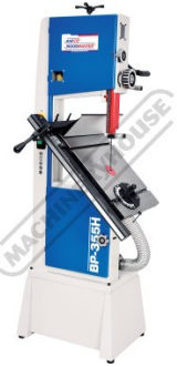
Shown with Table at 45 Degrees