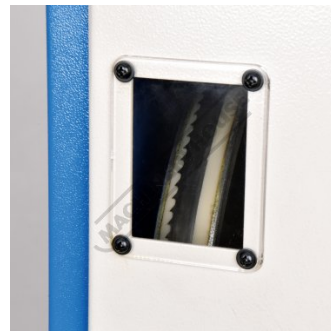
Blade Viewing Window