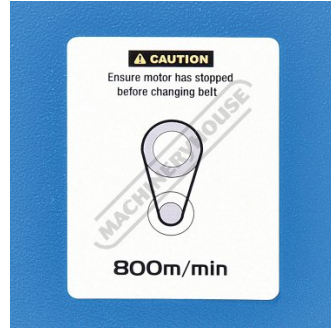
Blade Speed 800 metres per minute