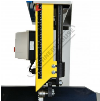
Blade Height Indicator