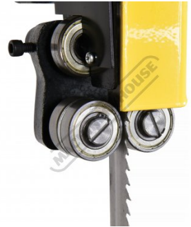
Ball Bearing Blade Guide