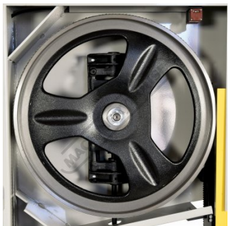
Heavy Duty Cast Iron Wheel