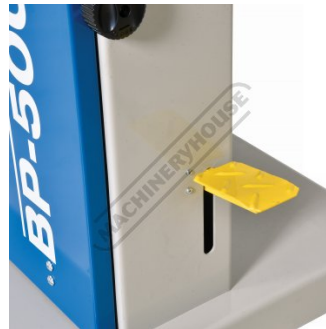
Foot Brake Lever