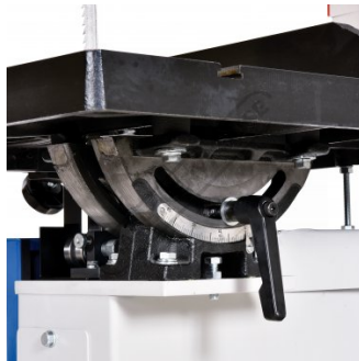
Table Tilt Adjustment