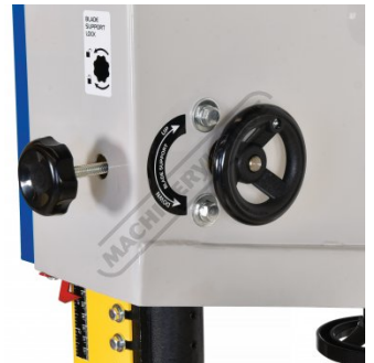
Blade Height Adjustment-Lock