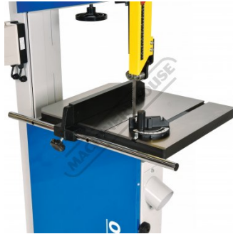
Table With Sliding Fence