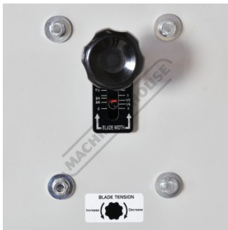
Blade Width And Tension