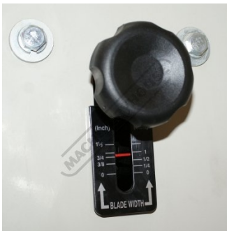
Blade Width Tension Indicator