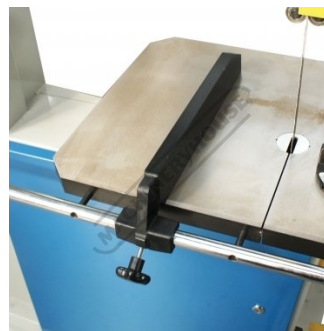
Sliding Rip Fence