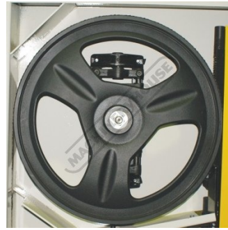
Heavy Duty Cast Iron Wheels