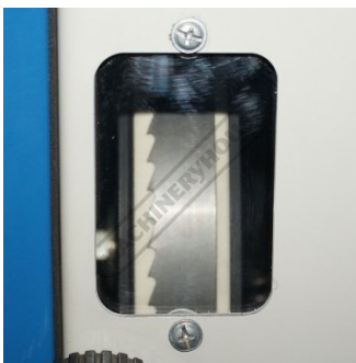
Viewing Window for Blade Alignment