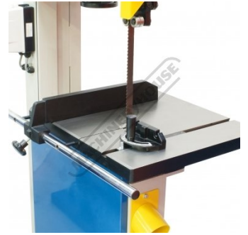
Table with Sliding Rip Fence