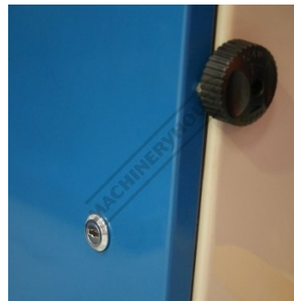
Key Lockable Blade Covers