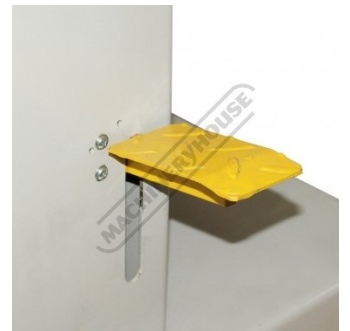
Foot Brake Lever