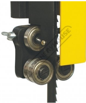
Ball Bearing Blade Guides