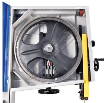
Heavy Duty Cast Iron Wheels