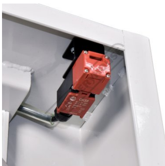
Safety Micro Switch on Doors