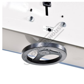
Blad Tension Lever