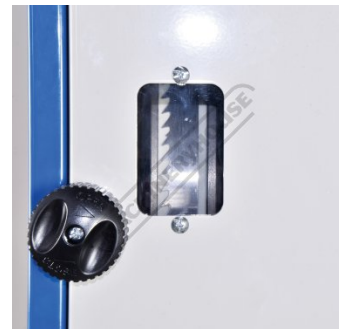
Blade View Window