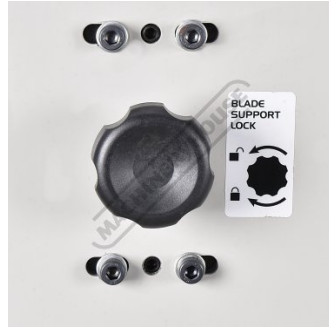
Blade Support Lock