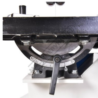
Table Tilt Adjustment