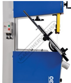
Cast Iron Table Tilts to 45 Degrees