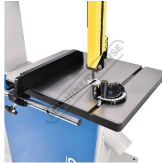
Cast Iron Table