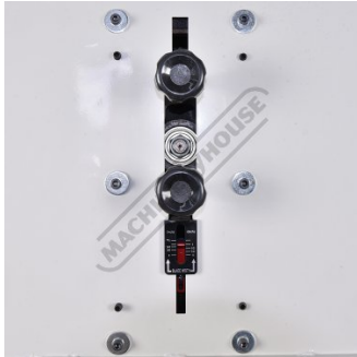
Blade Width Tension