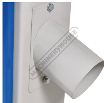
100mm Side Dust Chute