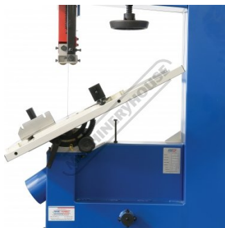
Cast Iron Table Tilts to 45 Degrees