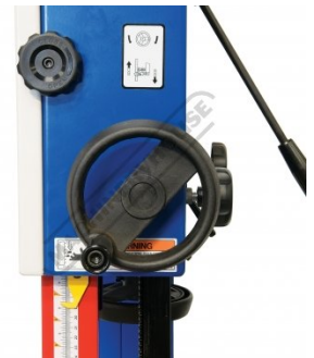
Blade Guide Height Adjustment Handle