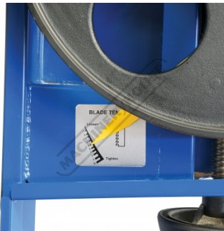
Blade Tension Sight Indicator