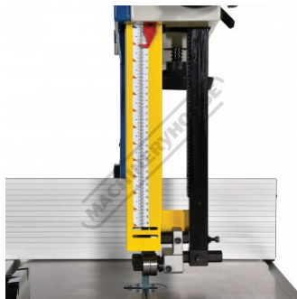
Blade Height Scale