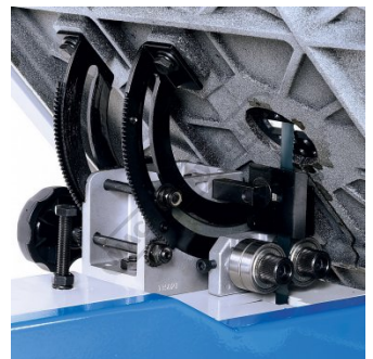
Lower Ball Bearing Blade Guide