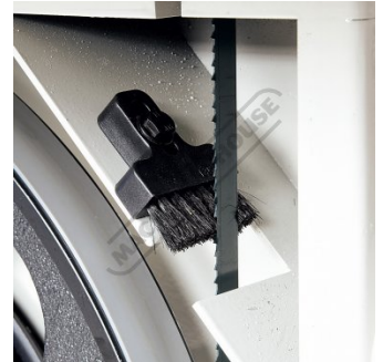
Blade Cleaning Brush