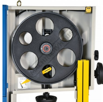
Heavy Duty Cast Iron Wheels