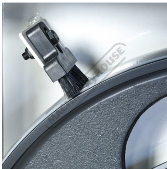
Wheel Cleaning Brush