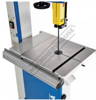
Large Cast Iron Table