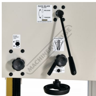
Quick Action Blade Tension Lever