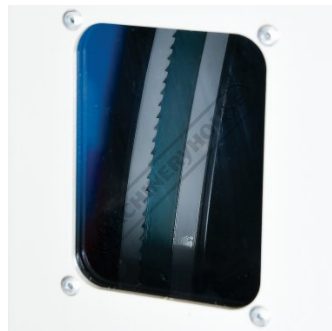
Blade View Window