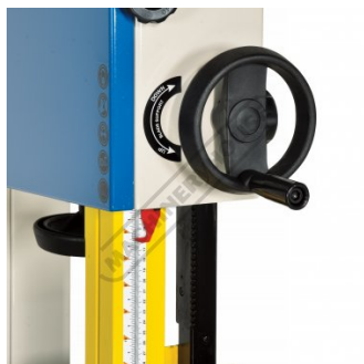
Adjustment Rack Pinion Cut Height