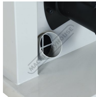
100mm Bottom Rear Dust Chute