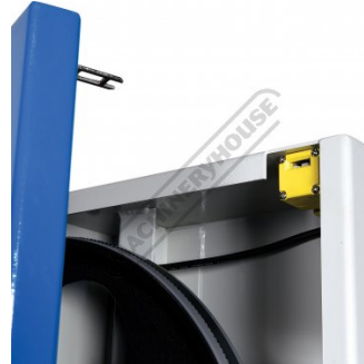
Safety Micro Switch On Door