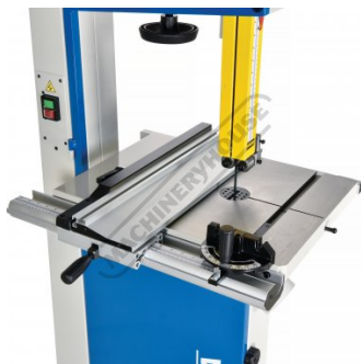
Rip Fence Shown In Low Position