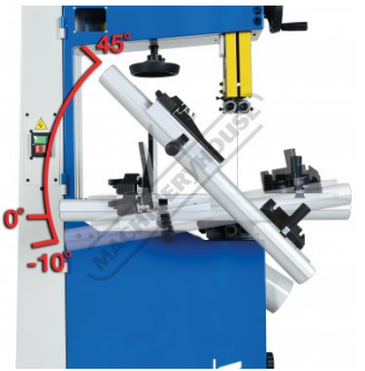
Table Angle Adjustment