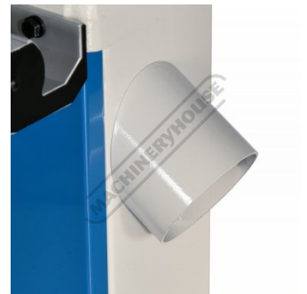
100mm Side Dust Chute