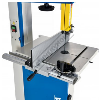
Rip Fence Shown In High Position