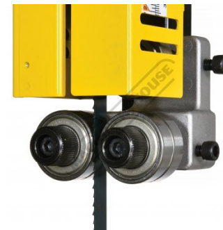
Ball Bearing Blade Guide