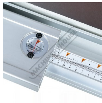
Rip Fence With Magnification Scale View