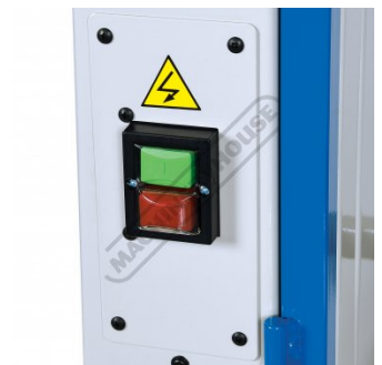
ON OFF Switch