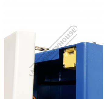
Safety Micro Switch on Doors