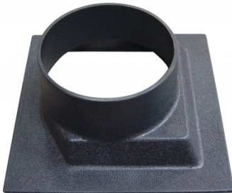
W339 Dust Hose Floor Sweeper Attachment