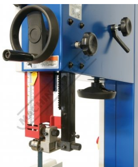
Rack & Pinion Adjustment on Top Blade Guide