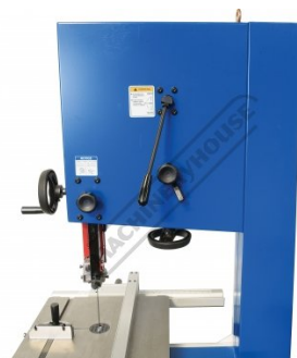
Quick Action Blade Tension Lever