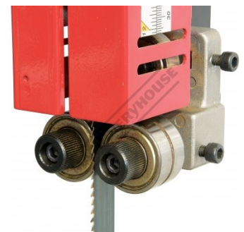
Ball Bearing Blade Guides