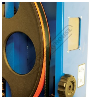
Orange Tyre for Ease of Blade Alignment Through Window