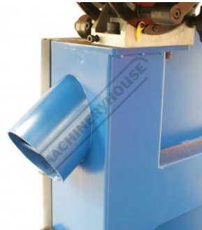
100mm Dust Chute