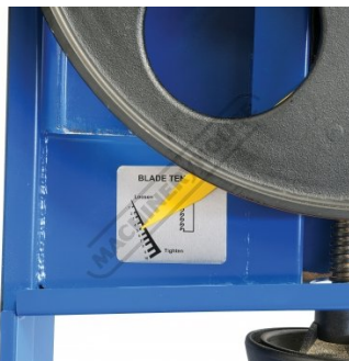
Blade Tension Sight Indicator