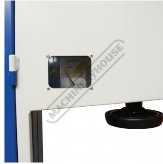
Blade Tension View Window