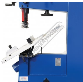
Cast Iron Table Tilts to 45 Degrees