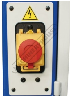
Magnetic Stop Switch