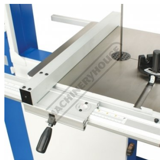
Sliding Rip Fence