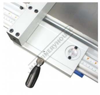
Rip Fence with Magnified Scale View