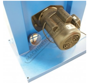
Bottom Rear Dust Chute