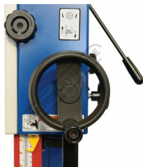
Blade Guide Height Adjustment Handle