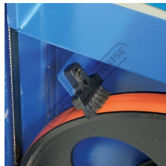
Blade Wheel Cleaning Brush