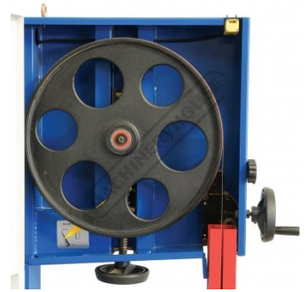
Heavy Duty Cast Iron Wheels