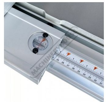
Rip Fence With Magnification Scale View