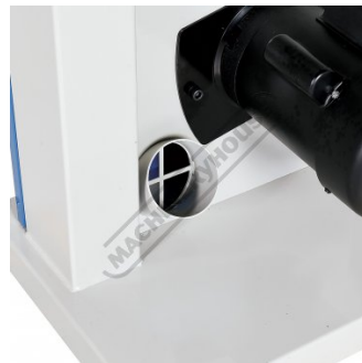
100mm Bottom Rear Dust Chute