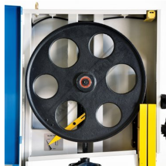
Heavy Duty Cast Iron Wheels