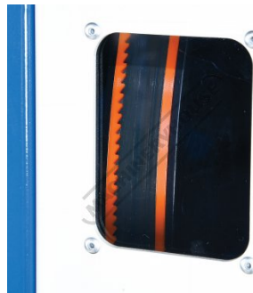
Blade View Window