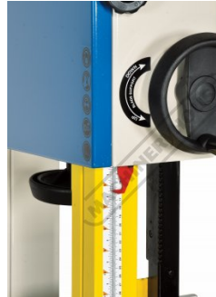
Adjustment Rack Pinion Cut Height