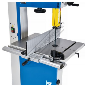
Rip Fence Shown In High Position