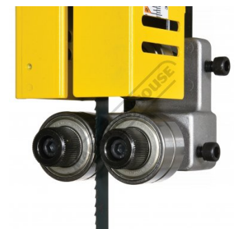
Ball Bearing Blade Guide