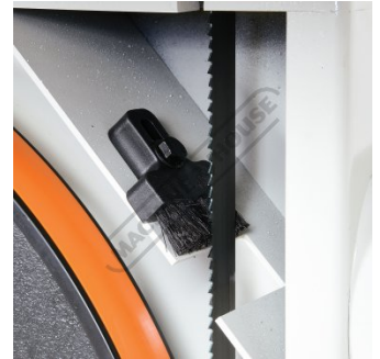
Blade Cleaning Brush