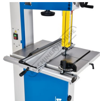
Rip Fence Shown In Low Position