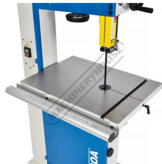
Large Cast Iron Work Table