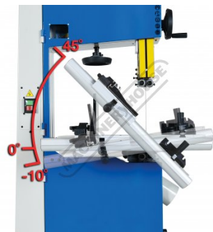
Table Adjustment Angles