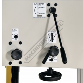
Quick Action Blade Tension Lever