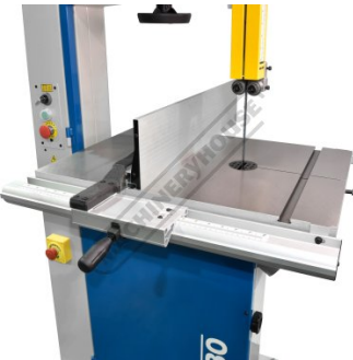
Sliding Rip Fence Up Position