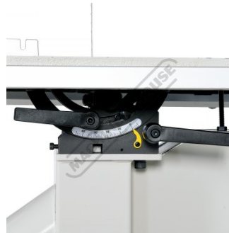
Table Tilt Adjustment