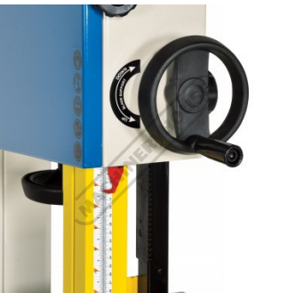
Rack Pinion Adjustment On Top Blade Guide