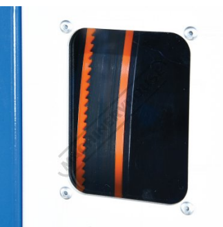
Blade View Window