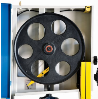
Cast Iron Blade Wheels