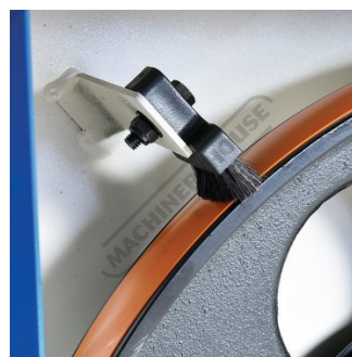
Wheel Cleaning Brush