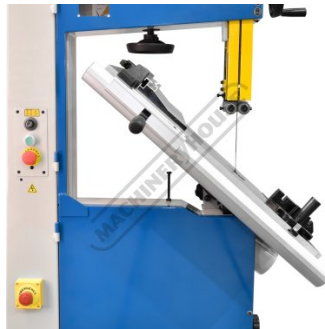
Cast Iron Table Tilts to 45 Degrees