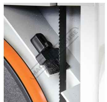
Blade Cleaning Brush