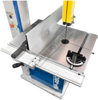
Large Cast Iron Table and Mitre Guide