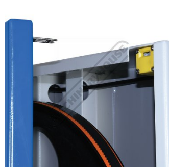
Safety Micro Switch On Door