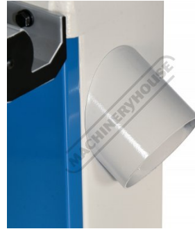
100mm Side Dust Chute