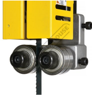
Ball Bearing Blade Guides