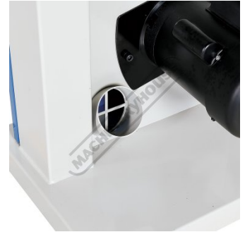
100mm Bottom Rear Dust Chute