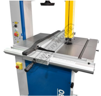
Sliding Rip Fence Down Position