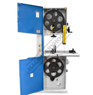
Shown With Blade Door Open