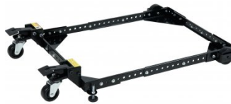
W931 Mobile Base - Heavy Duty