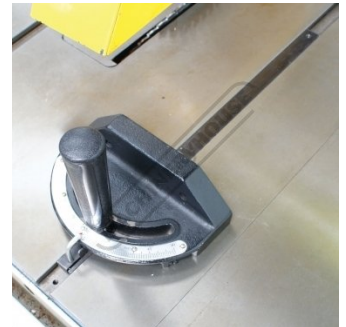
Heavy Duty Mitre Guide 60 degrees