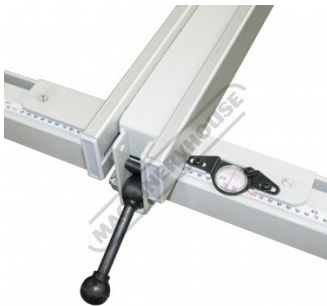
Single Lock Lever on Rip Fence with Magnified Scale