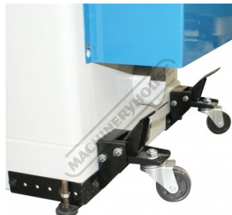
Swivel Wheels on Mobile Base with Leveling Screws