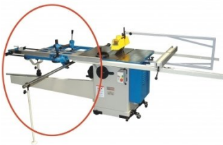
W458 Sliding Table