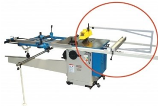
W459 Saw Guard Hood