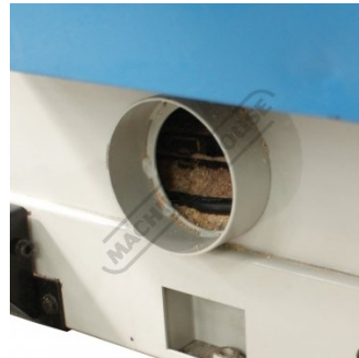
100mm Dust Chute