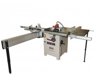
K053 Table Saw Package Deal