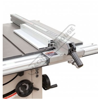
Rip fence Left View