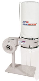
W332 Dust Collector