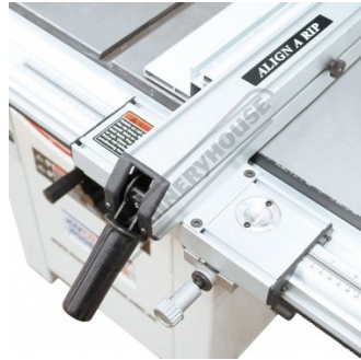
Heavy Duty Rip Fence with Micro Adjustment