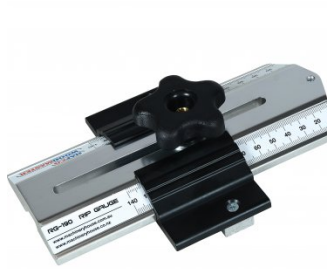
W311 Ripping Gauge