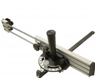
W308 Mitre Gauge & Fence