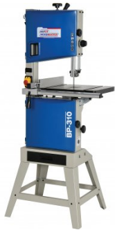
W952 Wood Band Saw