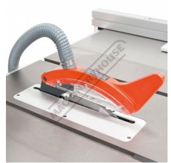
Blade Guard with Dust Hose