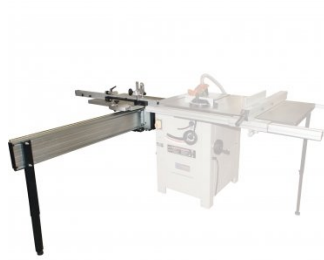
W487 Sliding Table