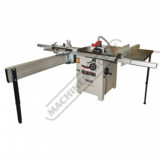
Material Clamp with Adjustable Guide Shown With Optional Table Saw