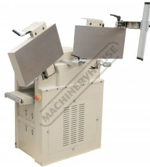
Thickener Setup - Rear View