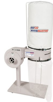
W332 Dust Collector