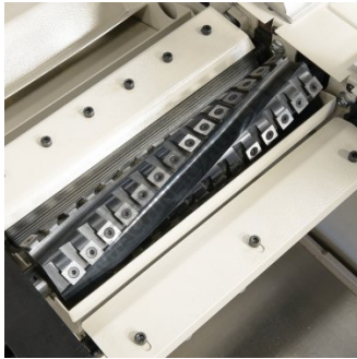
Spiral Cutter Head