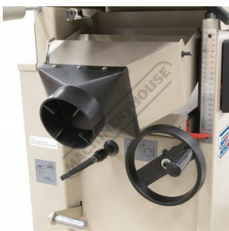
Dust Chute Set Up For Planer