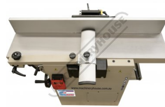
Front Top View