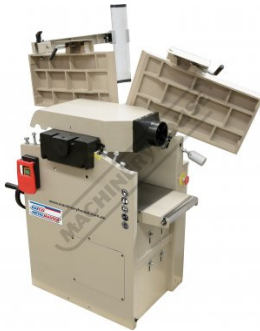
Thickener Setup - Front Right View