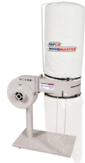
W332 Dust Collector