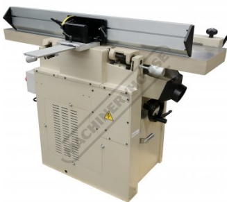
Rear Right View