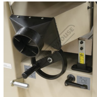
Dust Chute Set Up For Planer