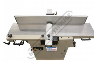
Front Top View