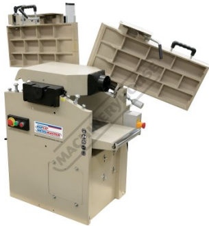
Set Up as a Thicknesser