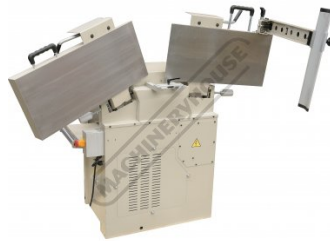
Thicknesser Setup - Rear View