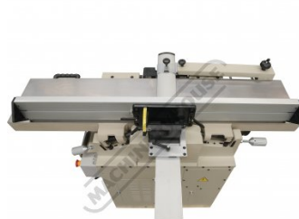
Rear Top View