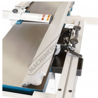
Adjustable Tilting Fence at 45 degrees