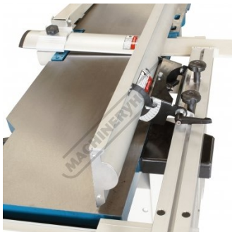
Adjustable Tilting Fence