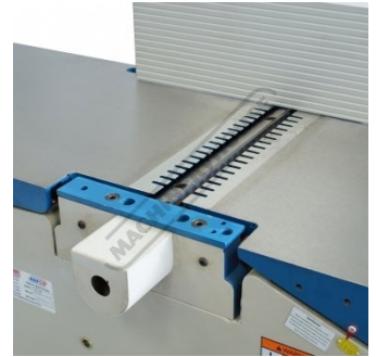
4 Blades Cutter Head