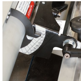
Adjustable Tilting Fence Scale