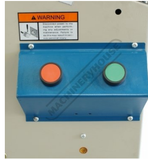
On Off Buttons