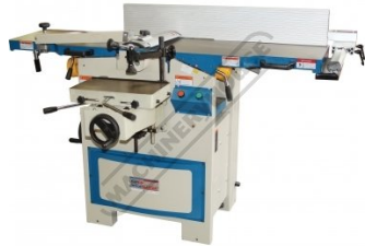
Shown with Optional Mortising Attachment (W615)