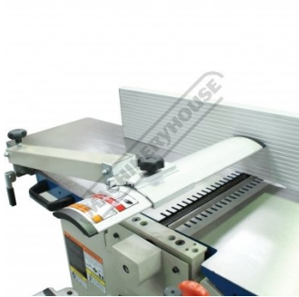
Adjustable Blade Guard