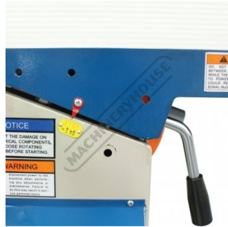
Table Height Gauge