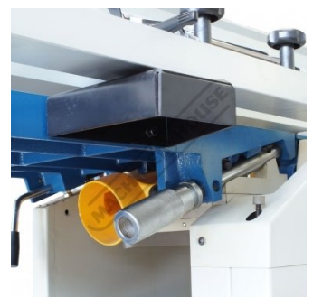
Table Height Adjustment