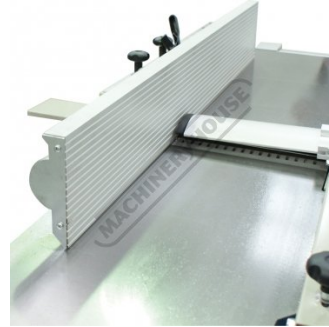
Aluminium Extrusion Fence