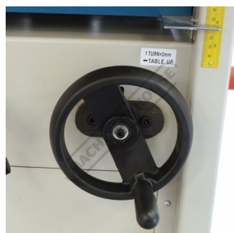
Table Height Adjustment Handle