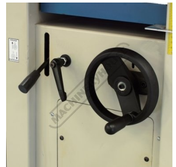
Thickener Table and Controls