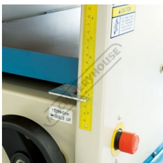
Thickness Height Scale