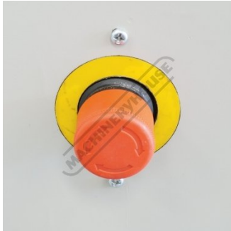
Safety Stop Switch