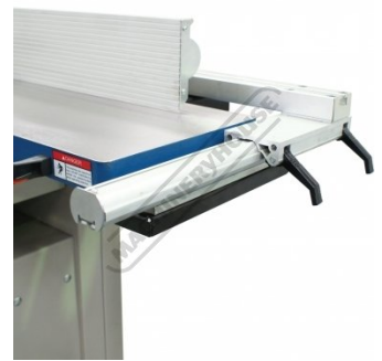
Adjustable Double Lock Fence